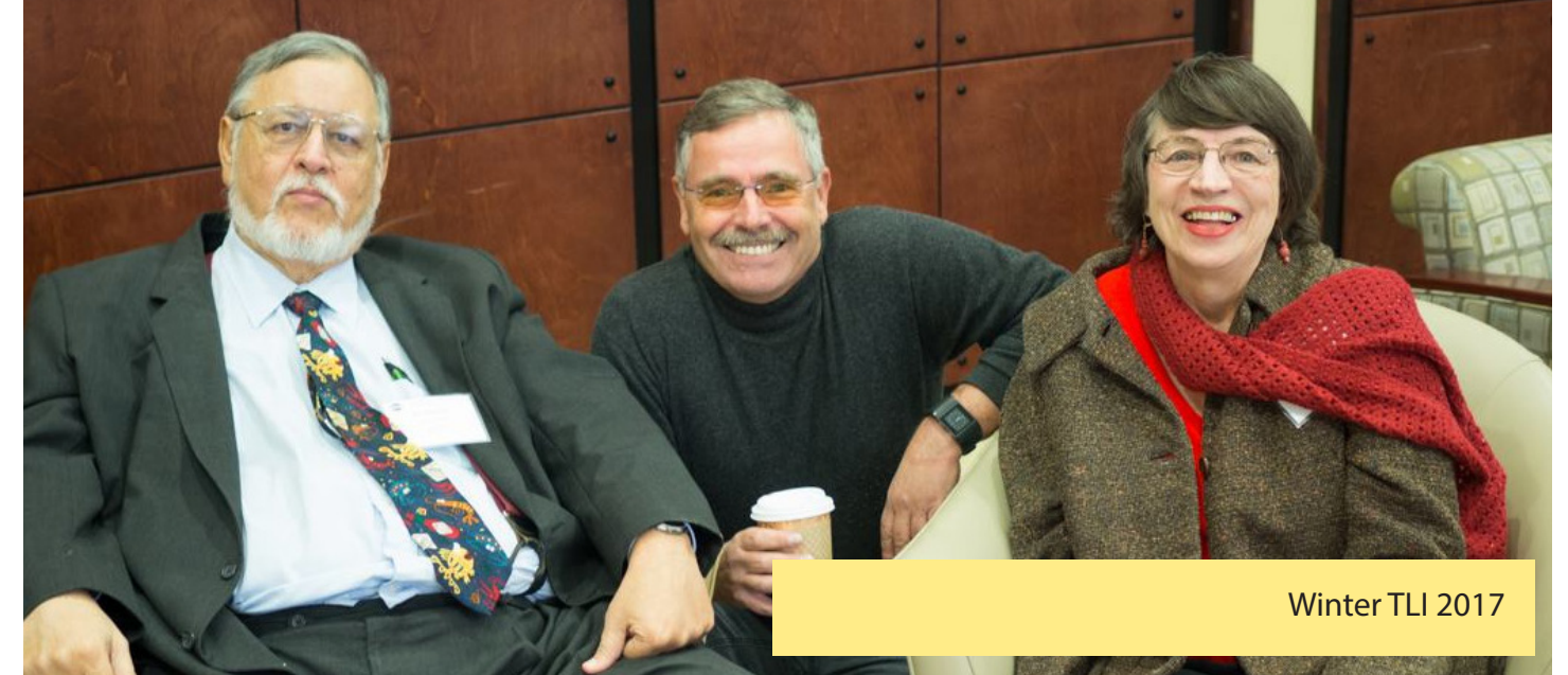
Winter TLI 2017

Check out the winter TLI content at: d13tm.com/winter-tli-presentations